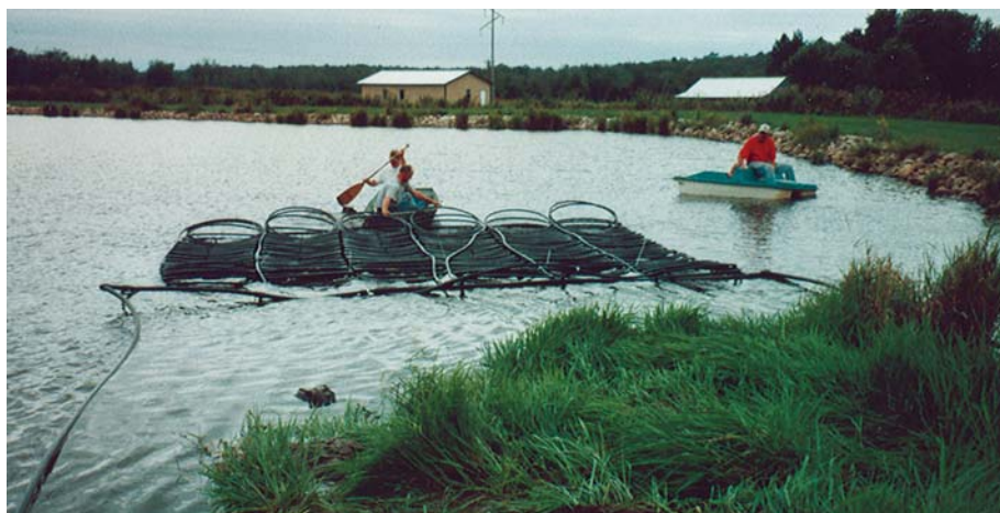
Technicians install and prepare the pond loop for the geothermal application.

Looking at a new heating system next spring? Give us a call. The ECONAR works well as a closed loop system, pond loop system, or if your well maintains a minimum of 12 gpm, an open loop. ■