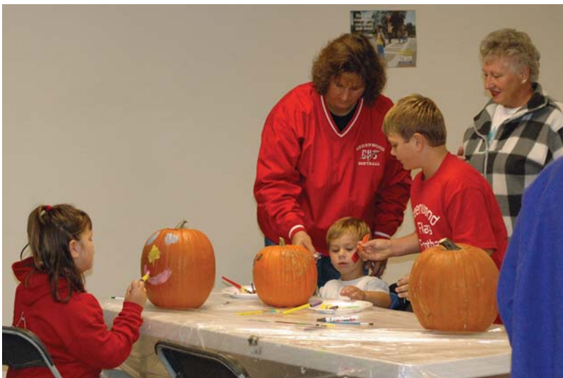
Young members enjoy pumpkin painting. Member Appreciation Day is for Clark Electric families!