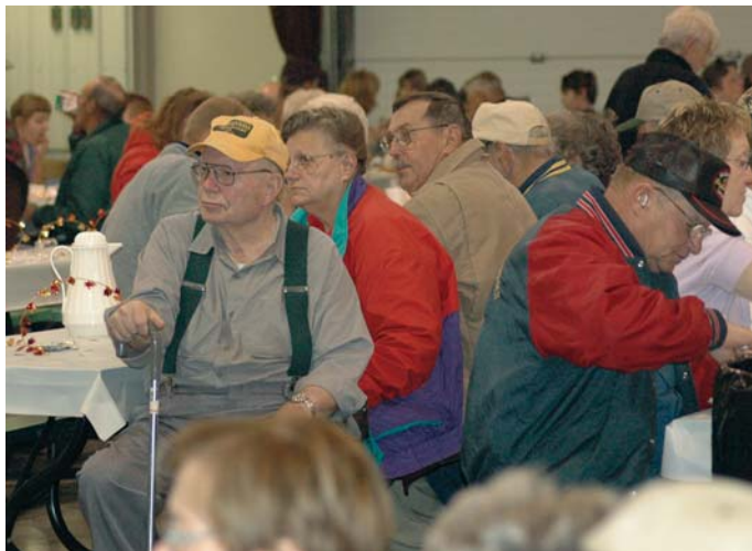
Members and guests enjoy a great pancake breakfast at the Member Appreciation Day. Hope to see you next year!